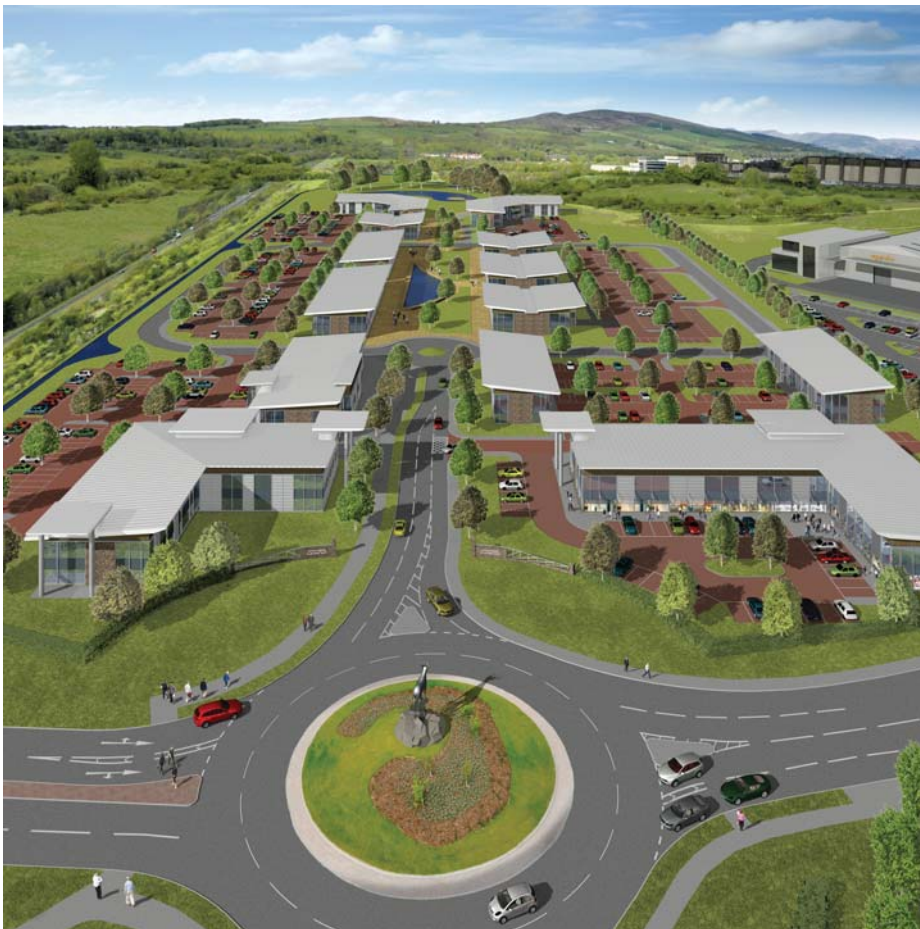
How the new Lomondgate business park will look

The master plan for Scotland's most scenic Business Park has been given the green light by West Dunbartonshire Council, signaling the way forward for a significant investment in Dumbarton with the potential creation of substantial numbers of new jobs.