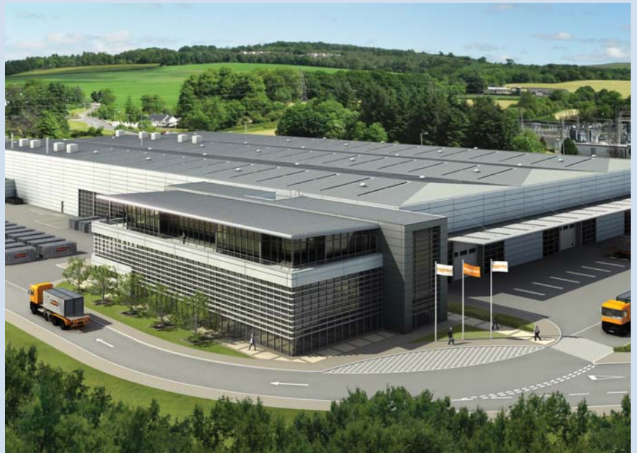
An artist's impression of the finished Aggreko facility

Comprising of a 160,000 sq ft manufacturing facility and 25,000 sq ft of office and ancillary accommodation, it will be located on a 16 acre site just off the A82 at Lomondgate in West Dunbartonshire.